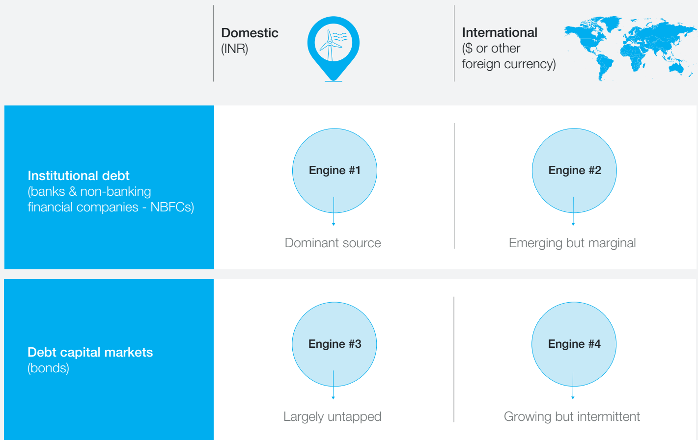
FIGURE 1 Four engines of utility-scale renewable energy debt finance

The domestic bond market has recently seen some limited activity 9 with respect to utility-scale renewable energy. But much more needs to be done on this front. The proposed solution bridges the gap between where credit ratings are for utility-scale renewable energy project loans and where they would need to be to access the domestic bond market in a self-supporting manner and at scale. There has been a significant upward movement in such credit ratings over recent years. A CEEW study released in December 2021 tracked the project loan ratings of 114 solar projects over the 2012-20 period. It found that “all solar projects